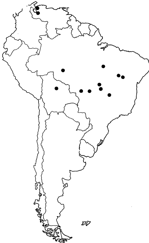
Fig. 1. Distribution map for Halictus lanei . Although the two specimens from Venezuela are at some distance from the other localities for H. lanei , they both have the characteristics of the species as described by Janjic and Packer (2001).

An additional two specimens have been found in the Museu de Zoologia (MZSP-USP), São Paulo from Cesar de Souza, São Paulo State. They have slightly longer heads than the other females listed above and also appear slightly darker. It is possible that they belong to a related, undescribed species.