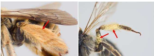
Figure 2. Detailed images taken from a user-friendly key to identify the bee families of the world (Packer and Ratti, 2009). Distinguishing characters (here: scopa on female hind legs) are described and highlighted. Further images show different forms of the character making correct identification much easier.

However, enormous knowledge gaps still exist in our taxonomic system, and taxonomic expertise is in decline. Through the Convention on Biological Diversity (CBD), governments have acknowledged the existence of a “taxonomic impediment” in 1998 on the fourth Conference of the Parties and launched the Global Taxonomic Initiative (COP 4 Decision IV/1). Thereby it is hoped to help alleviate the problem of shortage of taxonomic workforce which hinders sound work and management on biodiversity. Identification guides that can be easily used by non-taxonomists are still rare, and available for relatively few taxonomic groups and geographic areas (e.g. Eardley et al. 2010). For bees, there exist fully-illustrated keys to family level (Packer & Ratti 2009, Fig. 2) and the monograph of Michener (2007) with keys to genera and subgenera, but for many important groups of pollinators like Diptera (see Ssymank et al. 2008), there remains a need for keys and catalogues. DNA barcoding has shown promise for the identification of bees and other pollinators (Packer et al. 2009). However, additional genetic markers may be required to obtain clearer patterns of species differentiation.