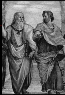
Plato and Aristotle from Raphael's School of Athens .