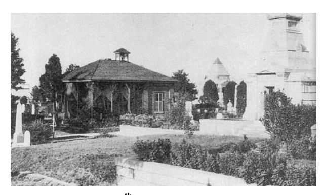
Figure 2. A 19<sup>th</sup>-century photograph may evoke a greater sense of aura than a more detailed computer rendering (from [26]).

photograph of Oakland Cemetery taken in the 1890s (see Figure 2), we have a heightened sense of the history of the place. The "poor" quality of the photo contributes to the sense of aura. Looking at this photo, we feel closer to the historical Oakland than we would by looking at a high resolution, 24-bit color computer graphic, even if the graphic is an historically accurate representation.