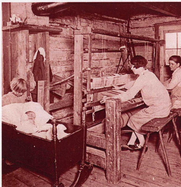
UNCOVERING CANADA'S HIDDEN HISTORY