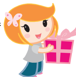
Saying thank you for a gift is showing you have manners.

The Children will study pond life. What creatures live in the pond?