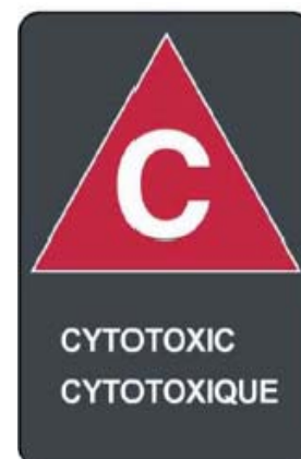
Figure 4: Cytotoxic Symbol

Cytotoxic waste, including sharps, is collected in a red puncture-proof container with the proper labeling as shown in Figure 4. Cytotoxic waste must not be placed in the same container as biohazardous sharps waste. Cytotoxic waste containers can be made available through Farquharson Stores.