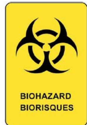
Figure 1: Universal Biohazard Symbol