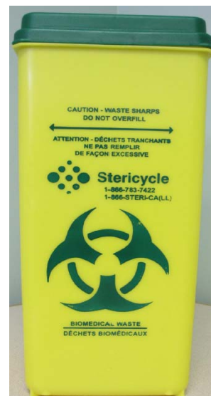
Figure 3: Sharps container

When the sharps container is full (ie. to the fill line) transfer it to the biomedical waste storage area. Sharps are placed in Stericycle cardboard boxes. The box must be lined with a yellow biomedical waste bag and stored in the biomedical waste walk-in fridge until it is removed by Stericycle. Waste bags, boxes and puncture-proof containers are available from Farquharson Stores.