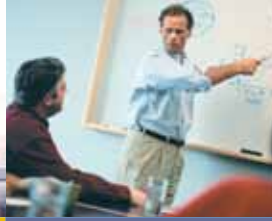
World class faculty and instructors