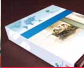
Comprehensive take-home materials

Register online at www.seec.schulich.yorku.ca , or complete and submit the following form: