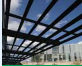
New state-of-the-art teaching facilities