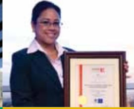
Framed certificate of course completion