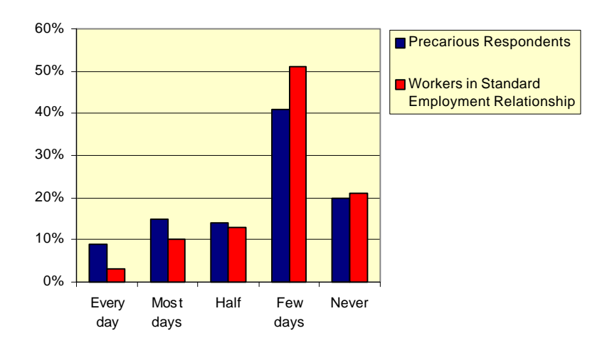
Figure 4: Days Exhausted After Work Last Month