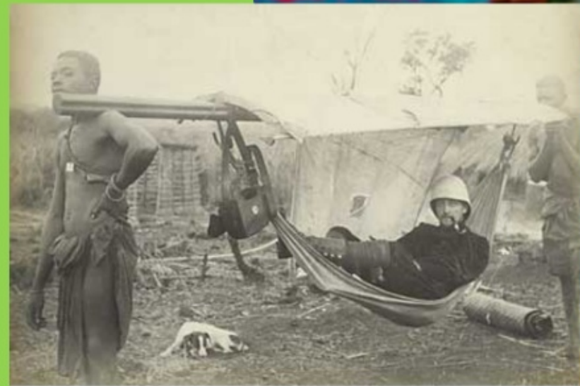
colonial exploitation and racism