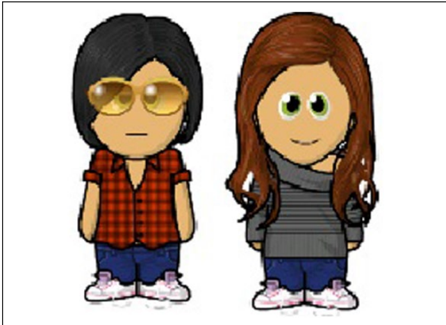
Figure 1. Example avatars.

avatar creator. An additional factor to consider is how revealing an avatar is with respect to its creator's personality. Avatars that communicate more of the creator's true personality might be more liked because people would seem to prefer others who present themselves in an open and honest manner. Therefore, we hypothesized that avatar creators who were perceived with higher levels of accuracy would also elicit greater intentions to befriend.