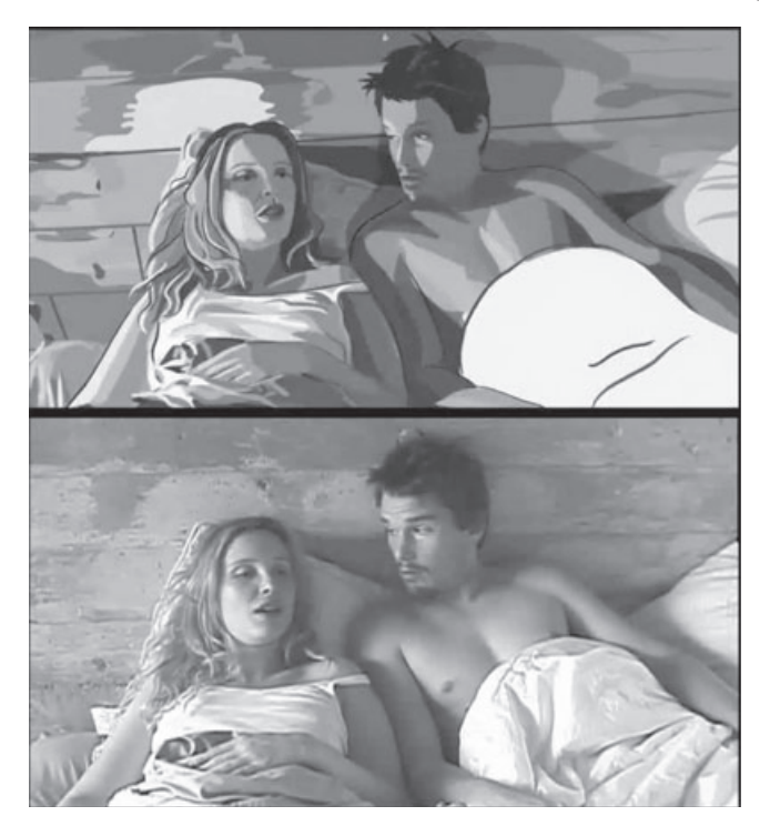
FIG. 1. Screenshot from the video stimuli employed by Mar et al (2006); cartoon version above real version.

but only instructed to watch the videos closely, which were presented without sound. We found that the right STS and TPJ were more activated while participants watched realistic scenes compared to cartoon scenes (see Fig. 2A). Even though the cartoon version was closely matched to the real version, the latter appears to have preferentially engaged brain areas known to be involved in mentalizing and the inference of intentions from behaviour.