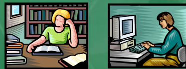
physical vs. online library