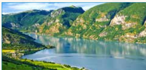
GENEVA AND THE FRENCH ALPS PRE-CRUISE OPTION