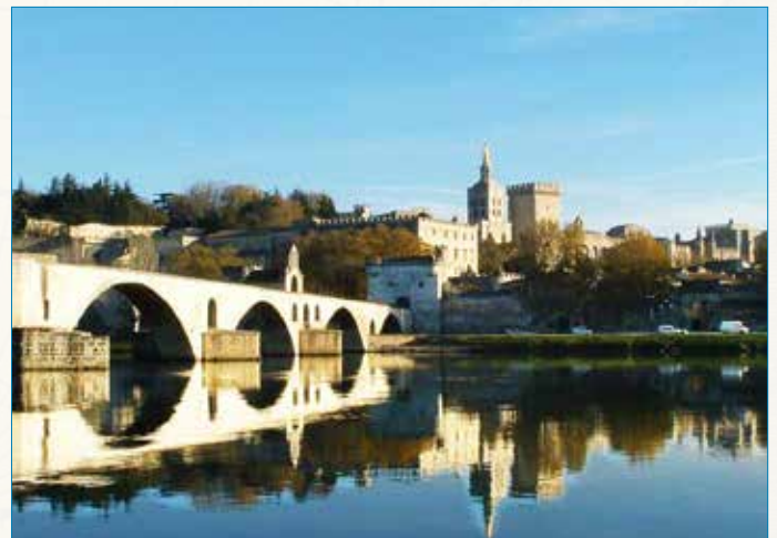
The landmark Pont d'Avignon was the only bridge built across the River Rhône during the Middle Ages.