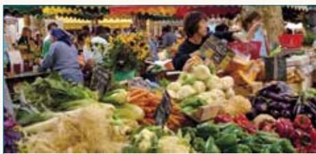
AIX-EN-PROVENCE POST-CRUISE OPTION

The Travel Program outlined here is subject to the features, final pricing and terms and conditions set forth in the published Travel Program brochure. Upon receipt of the published Travel Program brochure, you will be given 10 days to reconfirm your reservation, at which time any deposit(s) will become subject to cancellation fees.