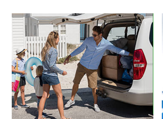
Car and Home Insurance How much can you save as a York alum? Find out now. Quote and buy online in minutes. Get a quote today.