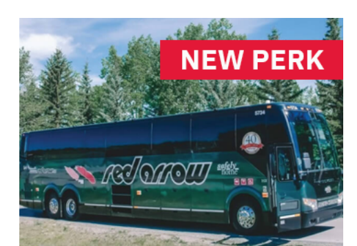
Bus Transportation Red Arrow is a premium

service, connecting Toronto, Kingston, and Ottawa with daily service. York U alumni receive 15% off fares. Learn