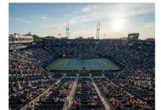
York Day Alumni Dinner at National Bank Open

obstetrician/gynecologist, Nobel Prize laureate and recipient of an honorary Doctorate of Laws from York University, called on Faculty of Health graduands to use their talent to fight injustice and care for those in need. Read more.