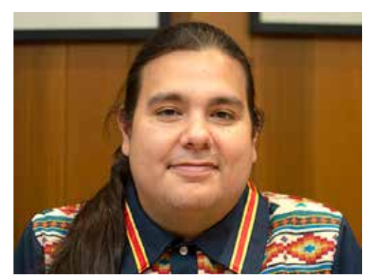
Indigenous students share reflections on National Indigenous Peoples Day National Indigenous History Month and National Indigenous Peoples Day are times of celebration and reflection. Each