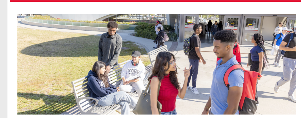
Maclean's 2024 rankings: York holds strong as one of Canada's top-five comprehensive universities, advancing to fourth place It is no secret that York is rapidly building momentum on the world stage and the latest rankings, released today by Maclean's, show the University's reputation continues to shine here in Canada with an impressive fourth place ranking – up one spot over last year. Read