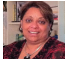
YorkU Professors awarded CBIE's Catalyst Award