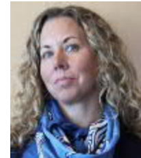
YorkU Professor invited to participate in UN Panel on Indigenous communities and environment