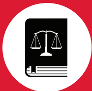
Law, Ethics & Human Rights