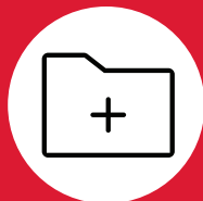
Information Systems & Management