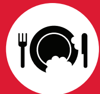
Poverty & Health