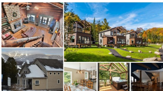
Above: Images of the Chalet

Signing up for this event will include coach bus transportation, lodgings, lift tickets, and rentals (optional). The accommodations are plenty featuring free Wi-Fi, a kitchen, kitchen ware, tea/coffee maker, cable television, toiletries and so much more. The chalet is extremely comfortable and will provide a great resting spot in-between being on the slopes.