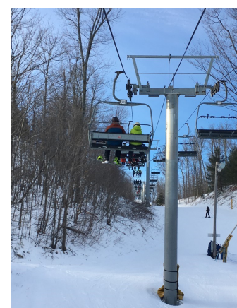
Above: Some past events hosted by York Alpine