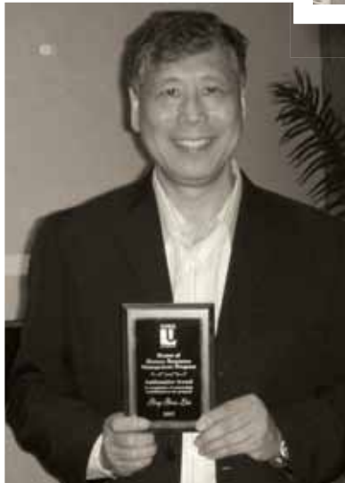
Gene Lai Ambassador Award (2007)