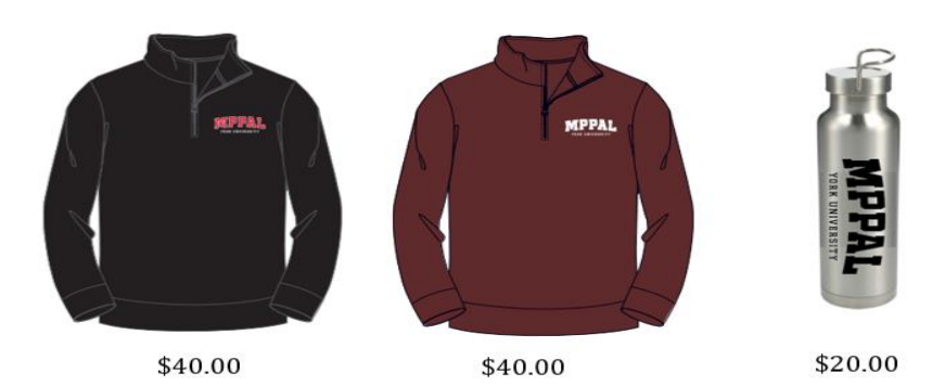
Items from Left to Right: Red Hoodie, Black Hoodie, Black Champion Anorak Full Zip Sweater, Black Quarter-Zip Sweater, Maroon Quarter-Zip Sweater, Copper-Insulated Water bottle

To learn more about the items and to place your orders, kindly fill out the <u>order form</u>. Once you complete the form, we will email you within 48 hours to confirm the details from your form, confirm the price and request your payment be made to <u>mppal.exec@gmail.com</u>. Please note orders and payments must be received before February 12, 2023 . If you have any questions, please email us at <u>mppal.exec@gmail.com</u>.