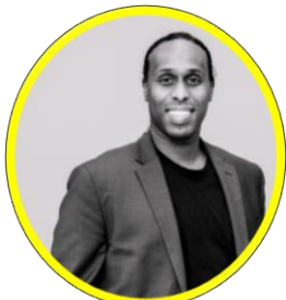
Fuad Abdi MPPAL 2014 Assistant Deputy Minister of Infrastructure at the Ministry of the Solicitor General