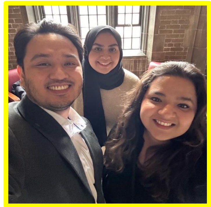
UofT Policython Team