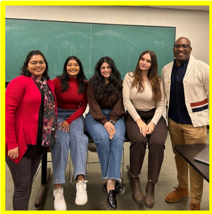
CAPPA/IPAC Case Study Team