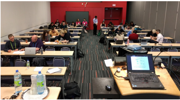
Figure 3: In-class experiment for this course at a previous CHI conference.