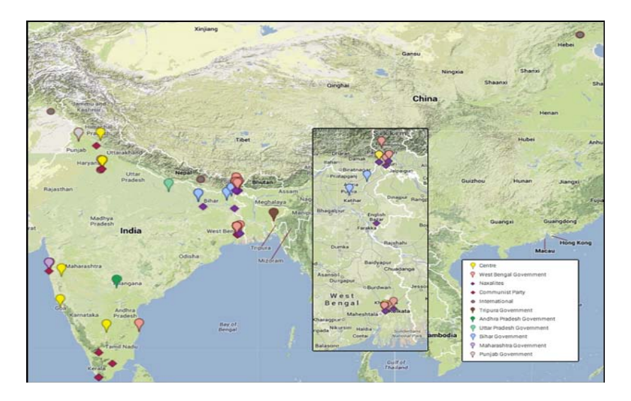
The Naxalite Movement in 1967 Inset: West Bengal. [Computer map]. No scale given. AutoNavi, Basarsoft, Google, MapaGISrael, ORION-ME, SK Planet, Zenrin. Mountain View, CA: Google Maps<sup>11</sup>

In the aftermath of the May 25 massacre, Naxalite activity spread throughout the northern region of West Bengal. The inset demonstrates that Naxalite actions were clustered around Naxalbari, while decisions by the West Bengal government and the communist politburo emanated from Calcutta. Although Naxalbari itself appears as a relatively flat agrarian region on the map, its northern reaches share the geographical attributes of the rocky, mountainous and the lush landscape of Sikkim. Naxalite activity occurred in far fewer numbers in Kerala and Andhra Pradesh than in West Bengal in 1967.