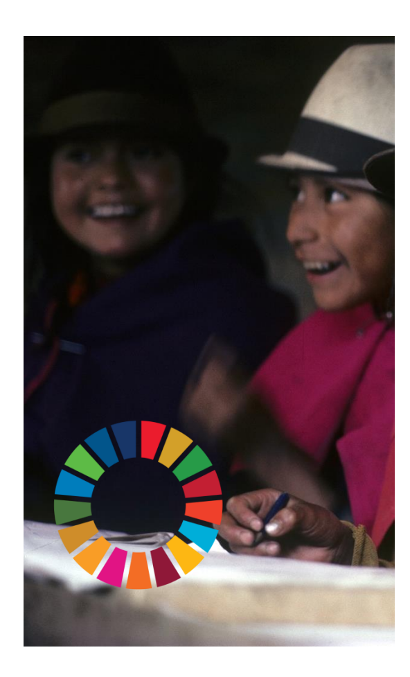
United Nations Permanent Forum on Indigenous Issues (UNPFII)