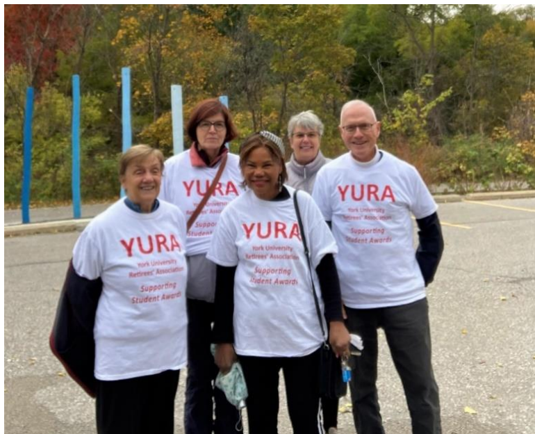
Members of the YURA team on the Tom Taylor Trail in Newmarket on a much colder October 14 h