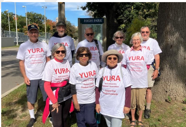
Members of YURA's team at High Park on October 4 th

For the 2022 Charity Challenge, York's ten registered participants were given the option of walking or running a minimum of 5 km on their own (e.g., in their own neighbourhood) as a “virtual” charity challenge; or in one of two 5 km walk events organized by YURA, one held at High Park on October 4 and the other on the Tom Taylor Trail in Newmarket on October 14.